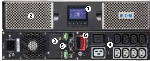
Eaton 9PX 3000VA